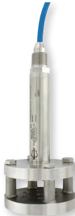
PBLTX (ATEX option available)